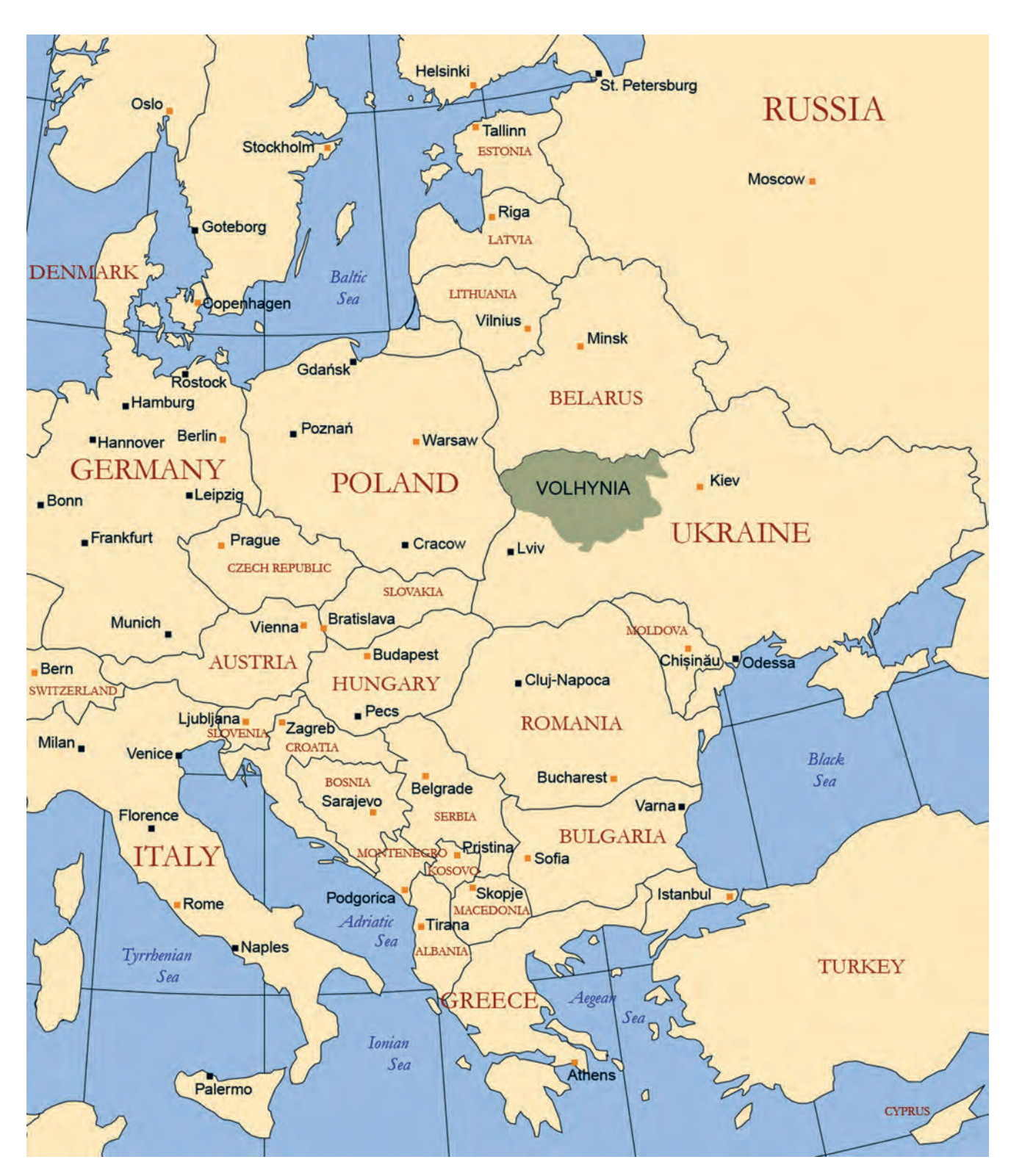
1. Volhynia on the map of Central-Eastern Europe.